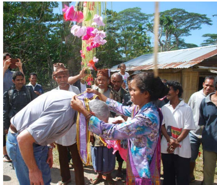
Being greeted at a highland village

Due to open defecation practices the water source is vulnerable to contamination. A community Action plan and