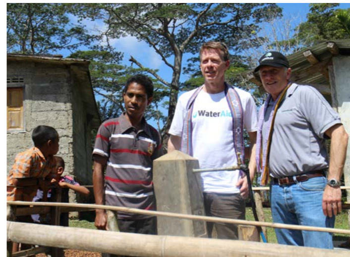
With the WaterAid representative at a highland village

The community had one shared toilet. Due to the Timor-Leste climate and flooding, open defecation was a potential source of contamination for communities located downstream.