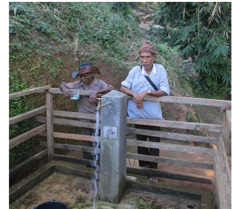
A tap stand provided through the WaterAid process