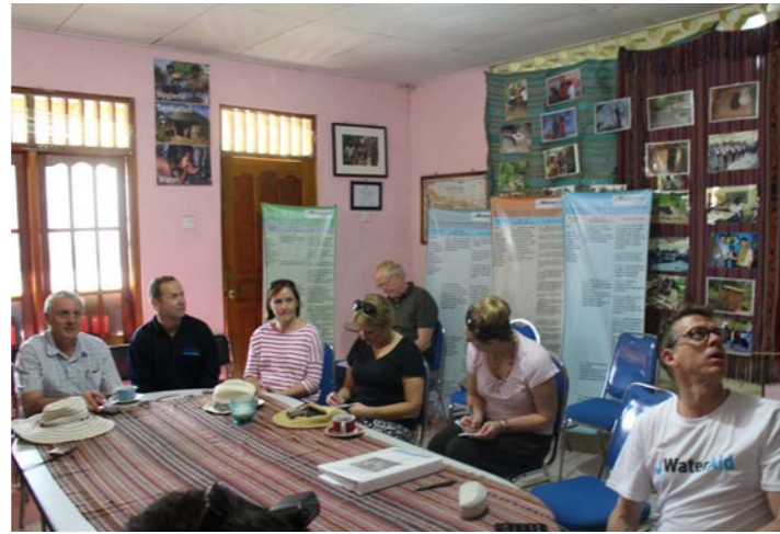
At the WaterAid office in Dili

The country is one of the world's poorest with high infant and maternal mortality rates. Timor-Leste has made spectacular progress in reducing its under-5 mortality from 12% to 6.5%