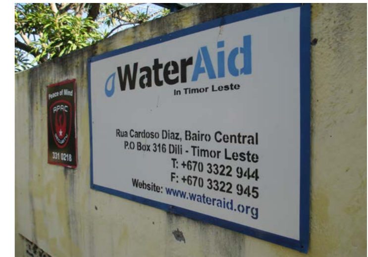
The WaterAid office in Dili