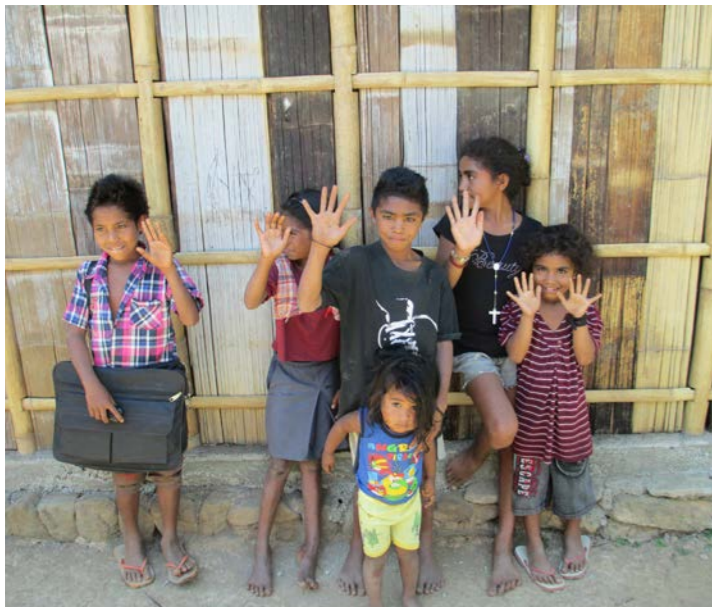
The beautiful kids of the village

The district is home to over 63,000 people, of those 92% live in rural areas. By the year 2012 WaterAid and its partners have provided an estimated 12,206 people with access to water supply, sanitation and hygiene services. WaterAid and partners have contributed to an approximate increase of 20% coverage with improved drinking water sources and sanitation by 2013.